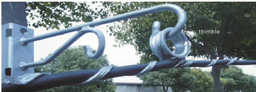
Helical armour rod